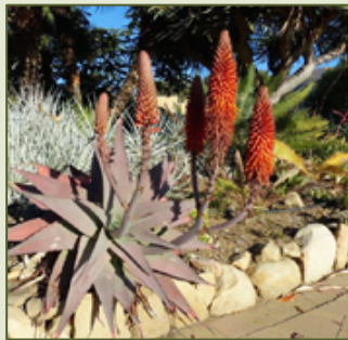
Pg 1: Aloe marlothii. Top: Jeff Chemnick beneath a Brachychiton rupestris. Above left: Aloe rubroviolacea.

Garden Tour, from pg 1 is a must-see. Jeff says an especially impressive male Welwitschia is coning, about 100 cycads are coning, and a number of cactus and a tall Pachypodium lamerei (Madagascar palm) are blooming as well. While cycads and aloes predominate, Jeff grows scores of other plants -- most with radial symmetry -- such as