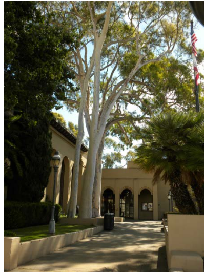
Corymbia citriodora at the Central Library rendered by the architects of the Faulkner Gallery, planted around 1930, and landmarked in 2012.